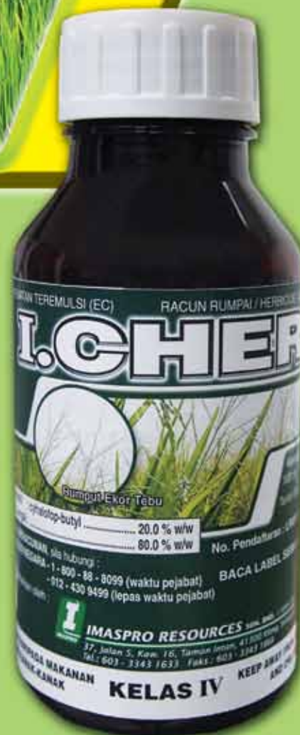
Rumput Ekor Tebu

Pilihlah I.CHER untuk kawalan rumpai yang luas : 選擇 I.CHER, 以全面控制雜草 :